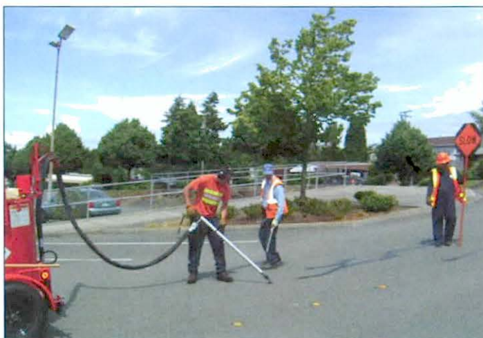
City maintenance crew tries out the new sealer.

In 2000, Des Moines adopted the Pacific Ridge Zone, Neighborhood Improvement Plan and Design Guidelines. These actions were the culmination of two years of planning aimed at establishing development regulations that would promote redevelopment of properties in the Pacific Ridge Neighborhood to create an attractive, safe and desirable area to work and live. Six years after its establishment, the City completed a review the Pacific Ridge Vision and Plan, to explore ways to jump start redevelopment of the neighborhood. At a March 22, 2007 study session, City Council received comments from developers, contractors, planners and real estate professionals regarding changes that should be considered to facilitate redevelopment of Pacific Ridge. Since that time, Council has adopted ordinances amending height and mixed use requirements in the Pacific Ridge (PR) zone. Specifically, the amendments increase the maximum building height to 85 feet for all properties zoned PR-CI east of Pacific Highway, and establish an additional height bonus to allow buildings up to 200 feet in the PR-R zone. This fall Council will be considering amendments to the parking requirements, building construction regulations and private recreational space. These ordinances represent the first steps in making improvements to the zoning code that support redevelopment of the Pacific Ridge neighborhood.