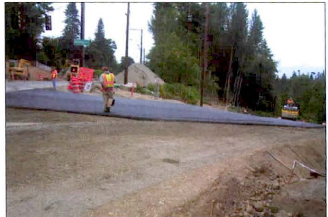
Paving of Woodmont Drive S.

Ongoing coordination will continue with the neighborhood, adjoining property owners, affected utilities and the Woodmont Elementary School to ensure that construction moves forward as smoothly as possible.